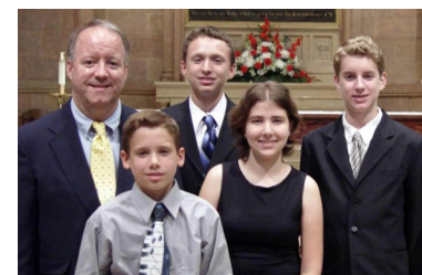
Four of our scholarship recipients pose with a Chapter member at a recital in 2005.