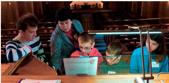
Lebanon Valley College will hosted a Pedals, Pipes and Pizza event on March 16, 2013 for kids in grades 4 to 8. This photo is from the PPP event.

The Harrisburg Chapter of the American Guild of Organists is a 501(c)3 not-for-profit educational organization, as registered with the Internal Revenue Service. All contributions are tax deductible for Federal income tax purposes.