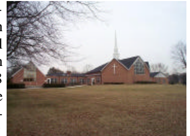
Faith Presbyterian Church

The congregation’s beginnings in 1956 involved several families meeting in private homes. In 1958 Sunday services were held in the Lingsletown Elementary School. The first building was dedicated