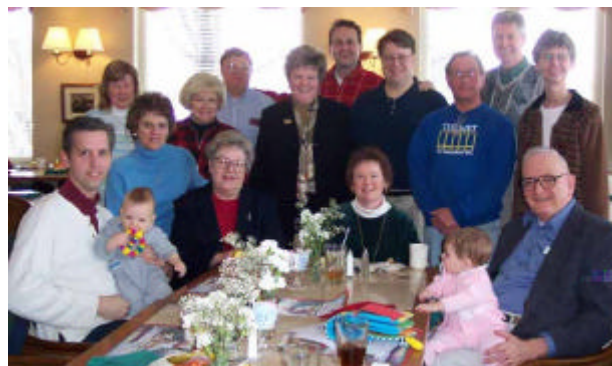
Members at the last luncheon: