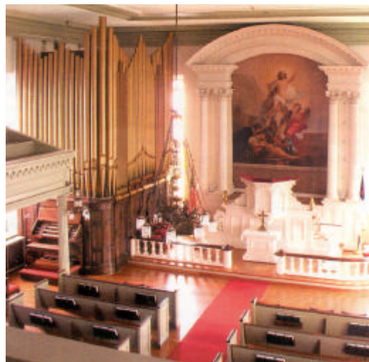
Miller Organ in Old Salem