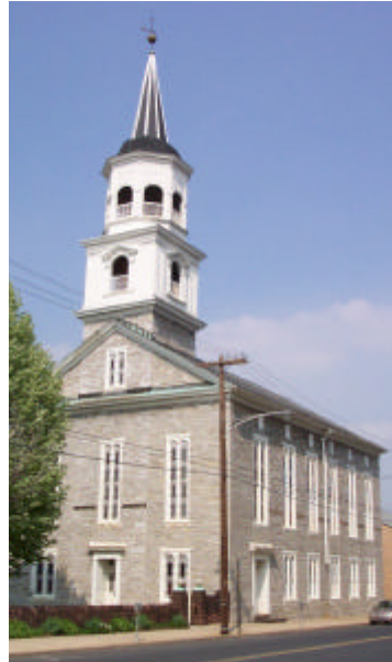
Old Salem Lutheran, Lebanon