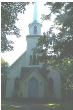
Haddam Neck Congregational Church