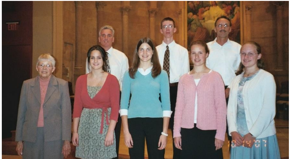
Recitalists at Our October 14 Program in Carlisle