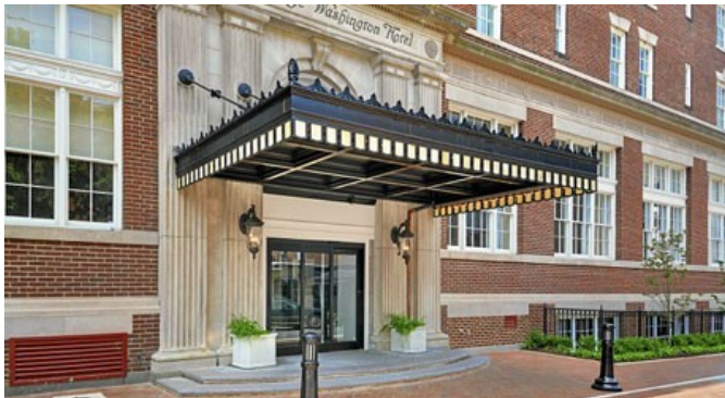
Wingate by Wyndham in Winchester, VA Room Rate is $95 per night + Tax Breakfast is included in the rate

The George Washington Hotel— A Wyndham Grand Hotel in Winchester, VA. Single-$129 + Tax Double-$139 + Tax Triple-$149 + Tax Quad-$159 + Tax Includes a Continental Breakfast