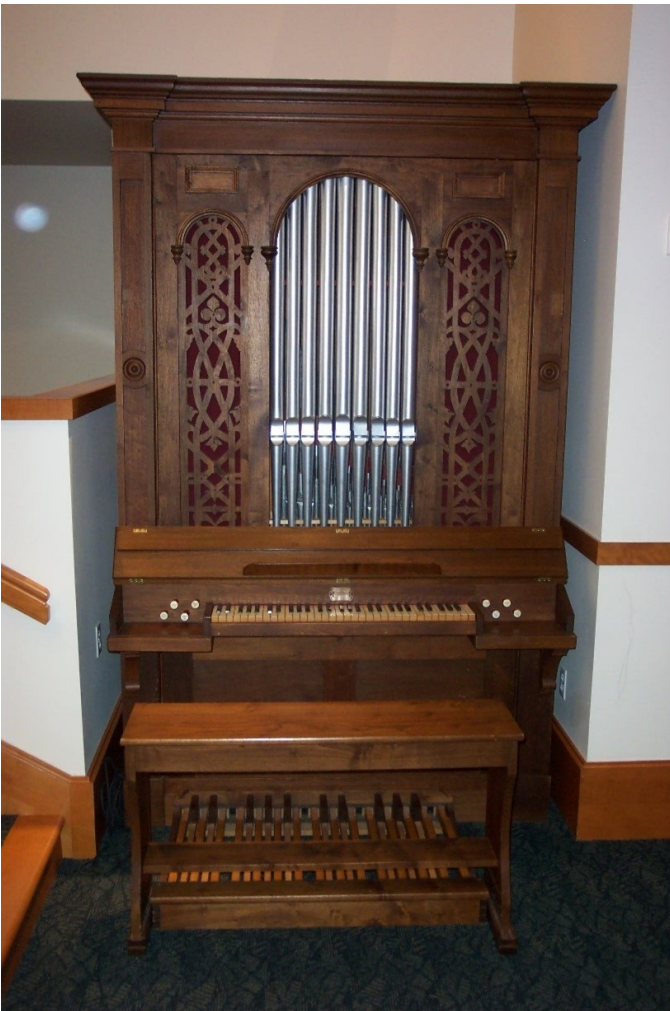
The Jardine Organ (above) Nicarry Meetinghouse (right)