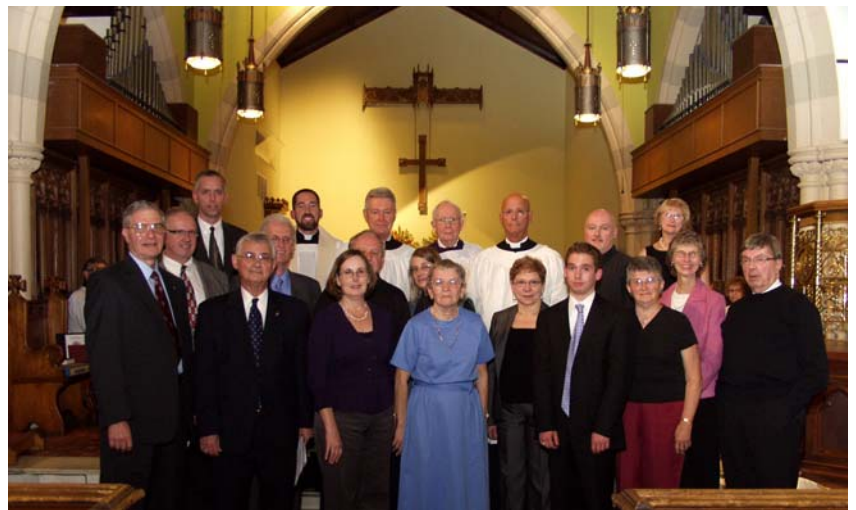
Board of Directors and Committee Chairs