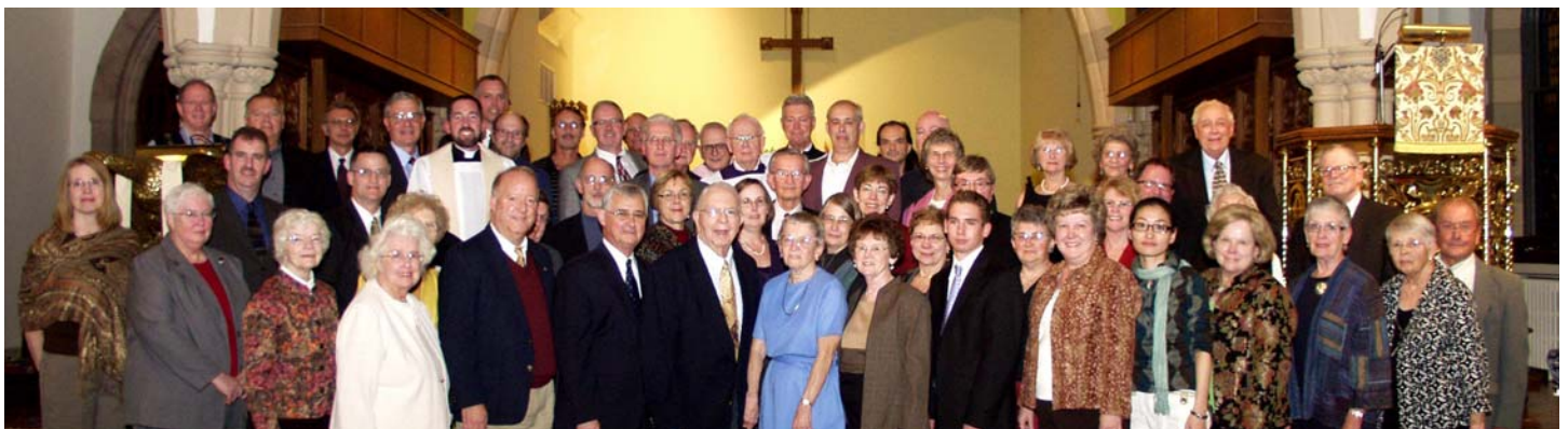
Current members in attendance at our 75 th Anniversary Celebration held October 17, 2010.