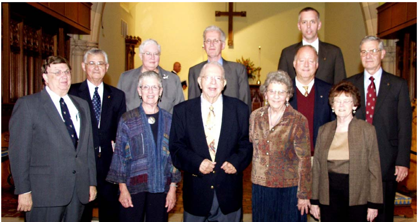
Our Deans Through the Years