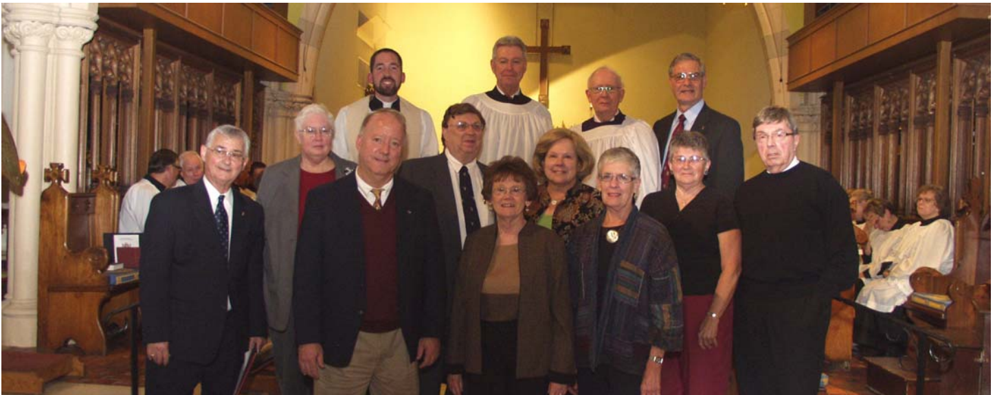
75 th Anniversary Committee Members