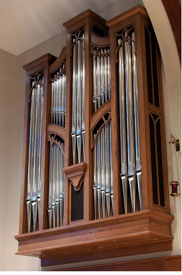
Great façade