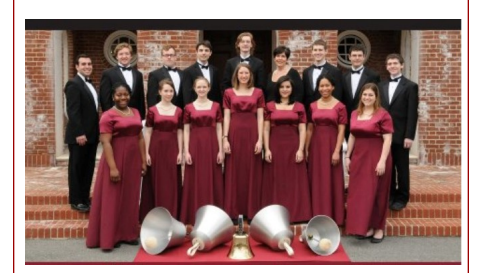
Friday, June 7, 2013—7:30 PM St. Paul Lutheran Church, 25 West Springettsbury Avenue, York. Freewill offering.