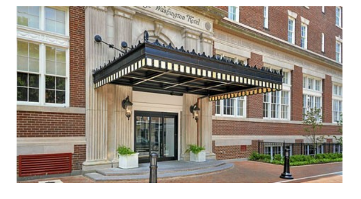
Wingate by Wyndham in Winchester, VA Room Rate is $95 per night + Tax Breakfast is included in the rate

The George Washington Hotel— A Wyndham Grand Hotel in Winchester, VA. Single-$129 + Tax Double-$139 + Tax Triple-$149 + Tax Quad-$159 + Tax Includes a Continental Breakfast