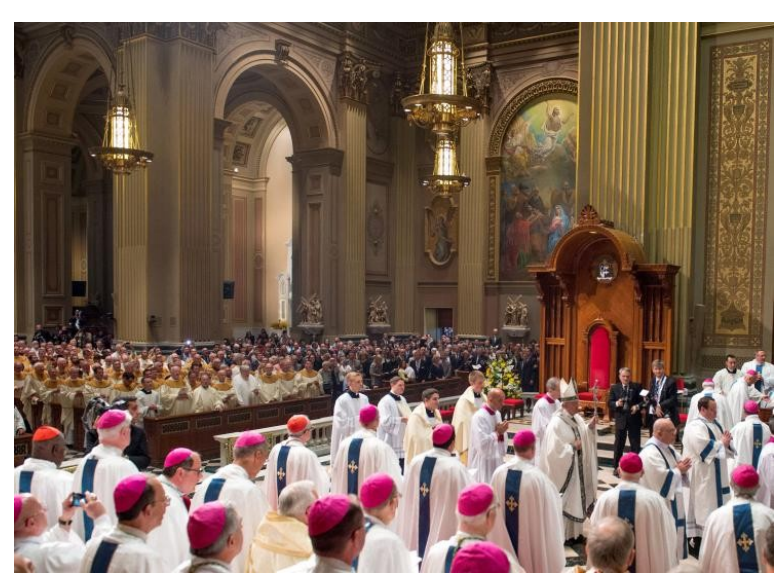
Pope Francis arrives for mass at Cathedral of Saints Peter and Paul Sept. 26, 2015, in Philadelphia.

The Holy Father arrived in Philadelphia on Saturday morning, September 26, 2015, and celebrated Mass in the magnificent Cathedral/Basilica of Saints Peter and Paul, located at 18<sup>th</sup> and Race Streets in Philadelphia. The following day His Holiness celebrated an outdoor Mass on the Benjamin Franklin Parkway which was attended by roughly 800,000 people. This Mass featured five choirs including the Archdiocesan Choir,