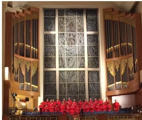
St. Thomas Choir of Men at the Co-Cathedral of the Sacred Heart

Wednesday's highlight and indeed for me the high point of the entire convention was the evening concert of the St. Thomas Choir of Men and Boys at the Co-Cathedral of the Sacred Heart. Having learned from my experience at Monday