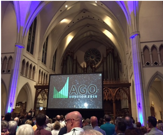
St. Martin Episcopal Church