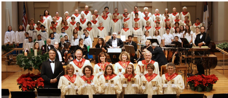
Group photo from the 2015 Christmas Concert

“An Alpine Christmas” holiday concert extravaganza will bring together adult, youth and children’s choirs, handbells, orchestra and guest soloists at 4pm Sunday, December 11 in the sanctuary at Derry Presbyterian Church, 248 East Derry Road, Hershey.