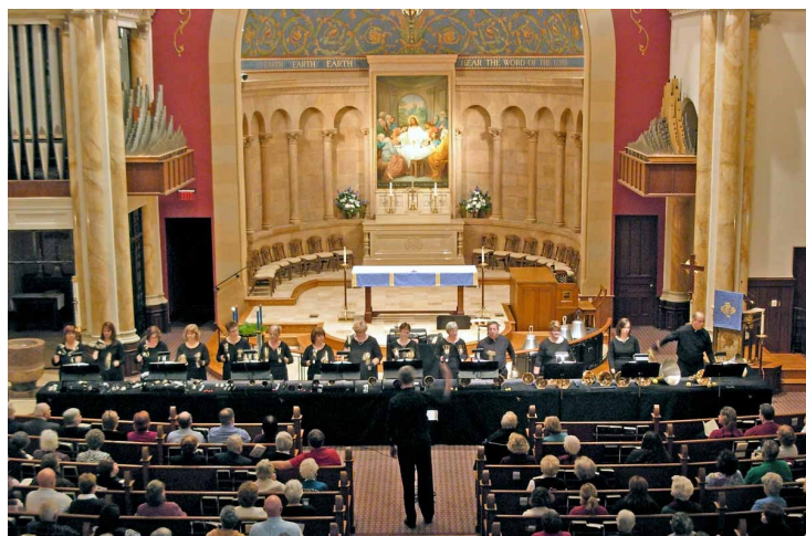
Hershey Handbell Ensemble performing at First Lutheran