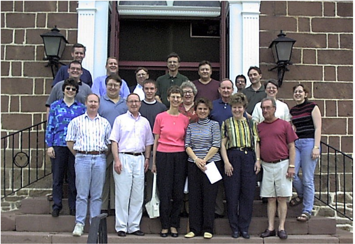
On the steps of the Basilica of the Sacred Heart, Hanover in April 2002