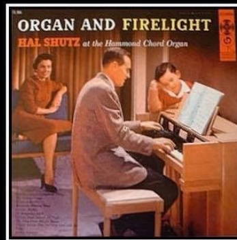
What elderly relatives think I do