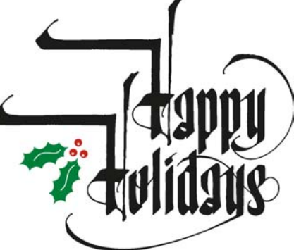
From the Editorial Board