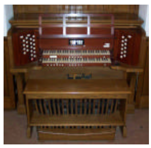
Skinner Console in the Chapel

of Market Square was built by M. P. Moller in 1991 and was the firm's Opus 11,805. It contrasts its predecessor in that it is placed in full view with the ability to speak directly into the Nave. The nomenclature is mainly French and an interesting feature is the divided Récit division which is housed in the two chambers that originally housed the entire gallery (Continued on page 7)