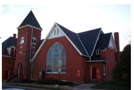
Duncannon Presbyterian Church

The congregation's roots go back to the late 1700s. In 1804 a congregational meeting held at the mouth of the Juniata River called Joseph Brady to pastor a charge of three churches. The first church building was erected in 1804 in then in 1841 a building in the town, then called Petersburg, was dedicated. Façade of the Great Open Diapason After being blown down by a storm,