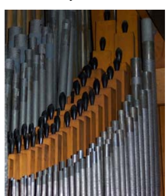
Great Organ Pipes

Opus 588 built by the Möller Organ Company was installed at about the time of the congregation's centennial anniversary in 1905. After 100 years this instrument remains today serving each week and is