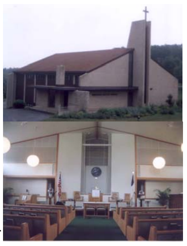
Westgate Baptist Church

The visit was wonderful for as I climbed through the three chambers, Chuck treated me to a colorful pallet of sound. I had the most intriguing time standing in the narrow aisle at the back