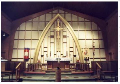
Sanctuary of St. Paul's

One stop of interest is the Dolcan Celeste in the Choir division.