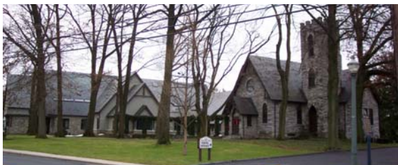
Derry Presbyterian Church, Hershey

This month we feature the instrument that will serve us for our January event: the Reuter pipe organ of Derry Presbyterian Church in Hershey.