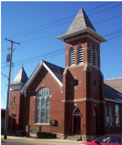
Former building of Trinity, 37 East Main Street, Palmyra