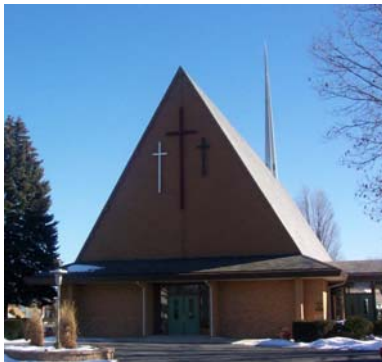
Trinity United Church of Christ, Palmyra