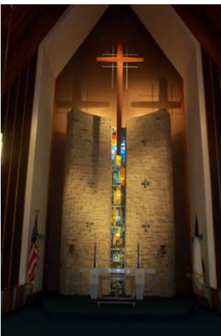
Chancel and Altar